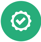
Homebuyer Surveys Level 2