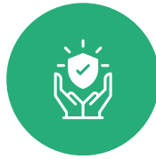
Building Surveys Level 3